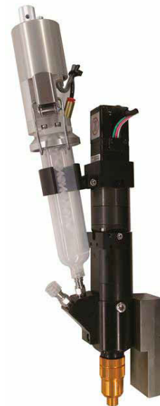
PCD4H Pump with Syringe Agitator/Mixer